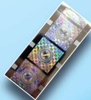
Registered pattern with both sides scan marks