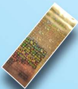
Unregistered or running pattern