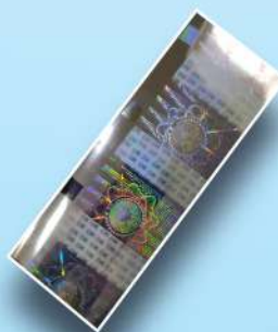
Registered pattern with scan marks